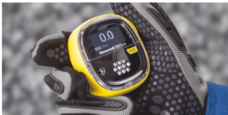
Easy to handle