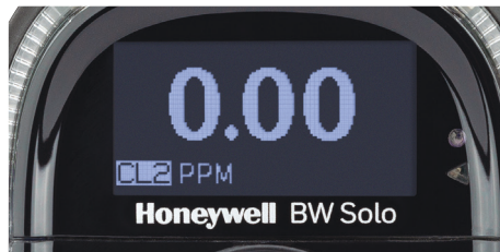
Easy to read