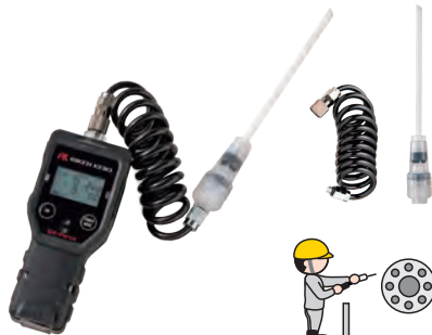
For measurements in specific locations within reach

(Tube length: Approx. 8 m) Part No.: 4384 0430 60