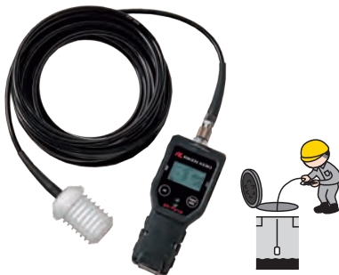
For measurements inside tanks

Can be fitted in place of the tapered nozzle (option) to allow readings to be checked even from a distance.