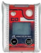
Heat-resistant case 1 Part No.: 4732 5047 10