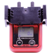
Example showing calibration adapter attached