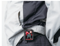
Attached to belt