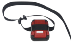
Arm band Part No.: 4123 9703 10