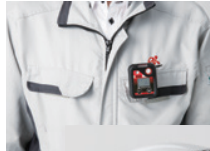
Attached to breast pocket