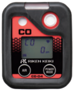
Protection cover (x1) Part No.: 4123 6450 20