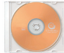
Data logger management program Part No.: 9811 0940 20