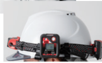
Example showing mounting on band attached to helmet

AAA alkaline batteries (x2) Part No.: 2757 0001 90