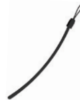
Hand strap Part No.: 0888 0605 90