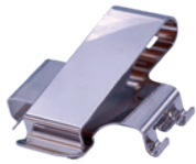
Belt clip (x1) Part No.: 4123 6463 30