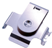
Helmet mounting clip 2 Part No.: 4732 4978 10